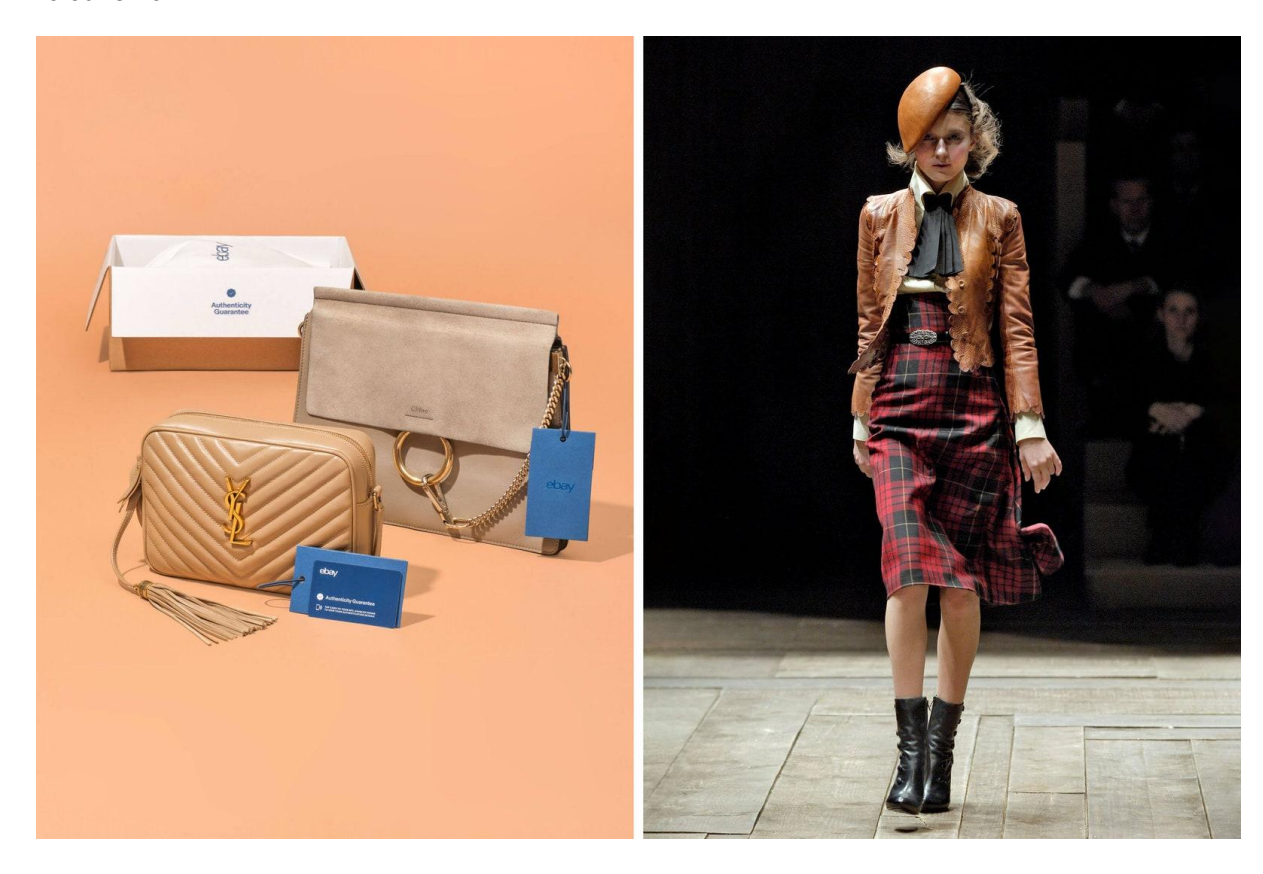
Ebay (left) adds NFCs tags to authenticated sneakers and luxury handbags. Alexander McQueen clients can sell back some pre-owned pieces (right), which will be given an NFC tag by Vestiaire Collective for use by future buyers.

In February, resale platform Vestiaire Collective partnered with Alexander McQueen on a <u>resale programme</u> that gives pieces an NFC tag that enables buyers to access item information. (Smartphones can "read" NFC tags without external hardware, but most RFIDs used in stores require an additional reader.) Earlier this month, <u>Ebay introduced a similar programme</u> that authenticates handbags from brands including Saint Laurent, Gucci, Celine and Balenciaga, and gives each an NFC hangtag, building on its sneaker NFC programme. <u>Nike</u> and <u>Adidas</u> already use near-field communication chips in many products, and as they establish buyback and recycle programs, the same IDs can authenticate products and carry provenance information.