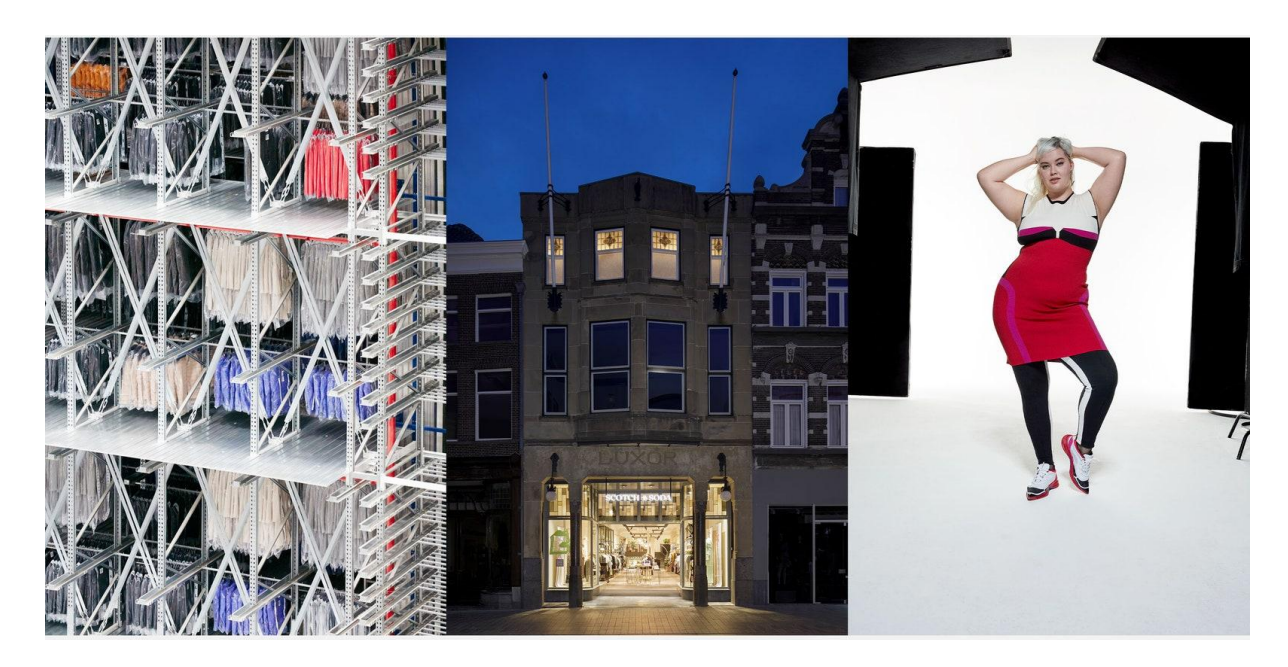
Mango (left) is expanding its use of RFIDs from warehouses to stores, and Scotch & Soda (centre) is adding them to stores globally this year. AZ Factory (right) uses NFC tags to communicate with customers.

Mango recently added RFIDs to its <u>new Barcelona flagship</u>, which it refers to as giving each item "a license plate" that allows the brand to know which garments clients take to the changing room and ultimately take home: "This technology ... is a way of having very relevant information that we previously only had through our online channel," the brand said in a statement.